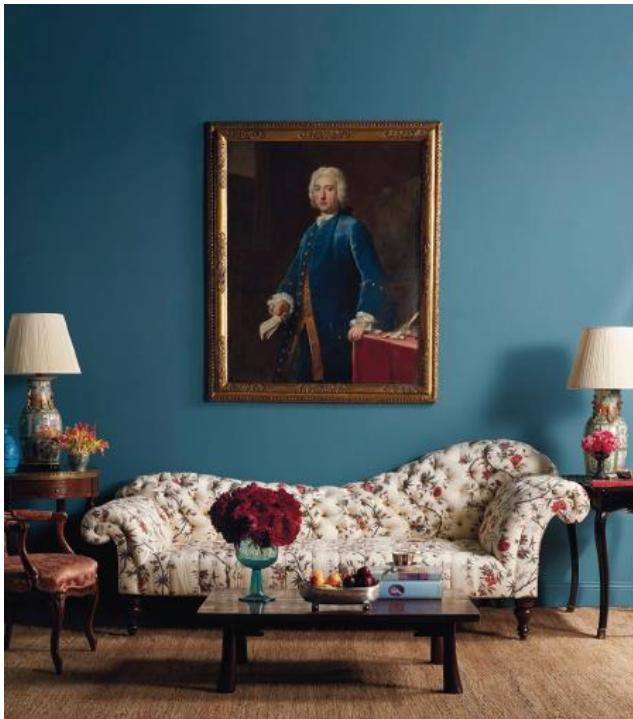
Vignette of select auction property styled by tastemakers

Christie's Interiors Auction: August 21-22, New York