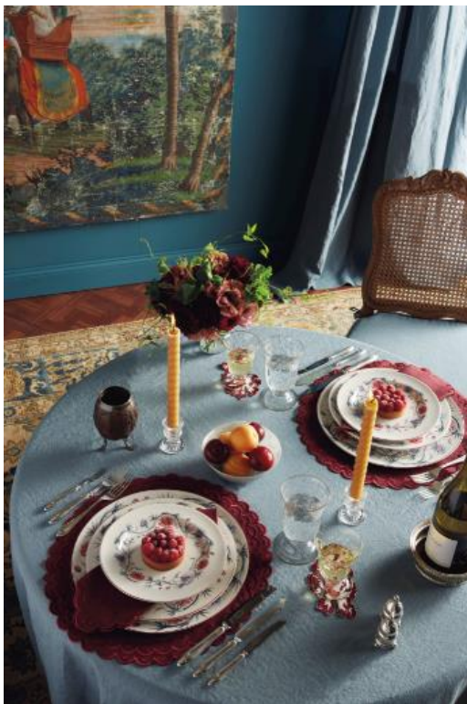
Tableware designed by CeCe Barfield, Inc.

CECE BARFIELD, INC. AND MARKARIAN CAPSULE COLLECTIONS AVAILABLE AT BERGDORF GOODMAN